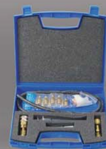
Sealant Detector Kit™