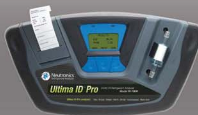
Ultima ID Pro™

Ultima ID™ 1234yf is part of the full line of Neutronics Refrigerant Analyzers