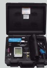
A/C Service Tools