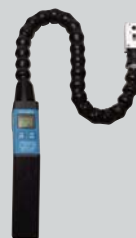
IR Temperature Probes

Ultima ID is part of the full line of Neutronics Automotive service products: